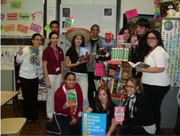
Pictured are students in Spanish 4 Honors class in front of the new bookcase. They are holding various items that were also donated.