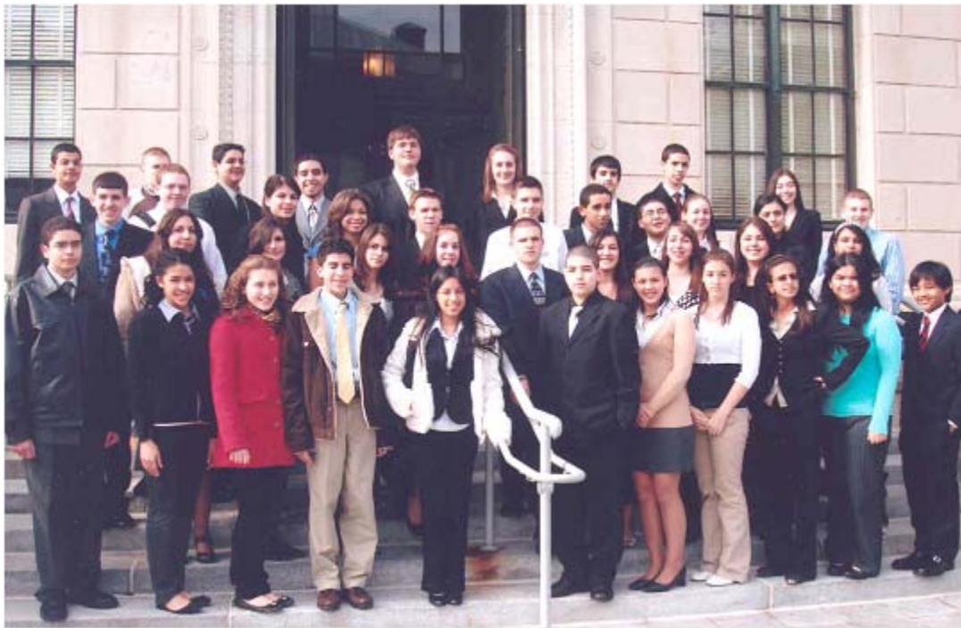
Pictured are Bayonne High School sophomore English and History Honors students at The State House in Trenton, New Jersey.